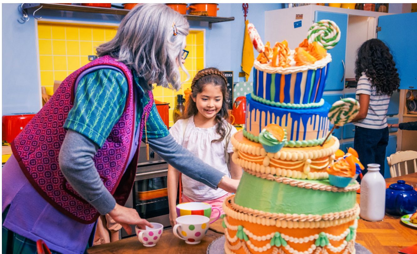
Image: © The Official Paddington Bear™ Experience. P&Co. Ltd./SC 2026

https://paddingtonbearexperience.com/schools/